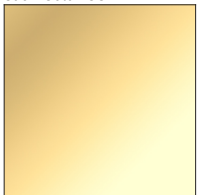
Satin Gold - SGD